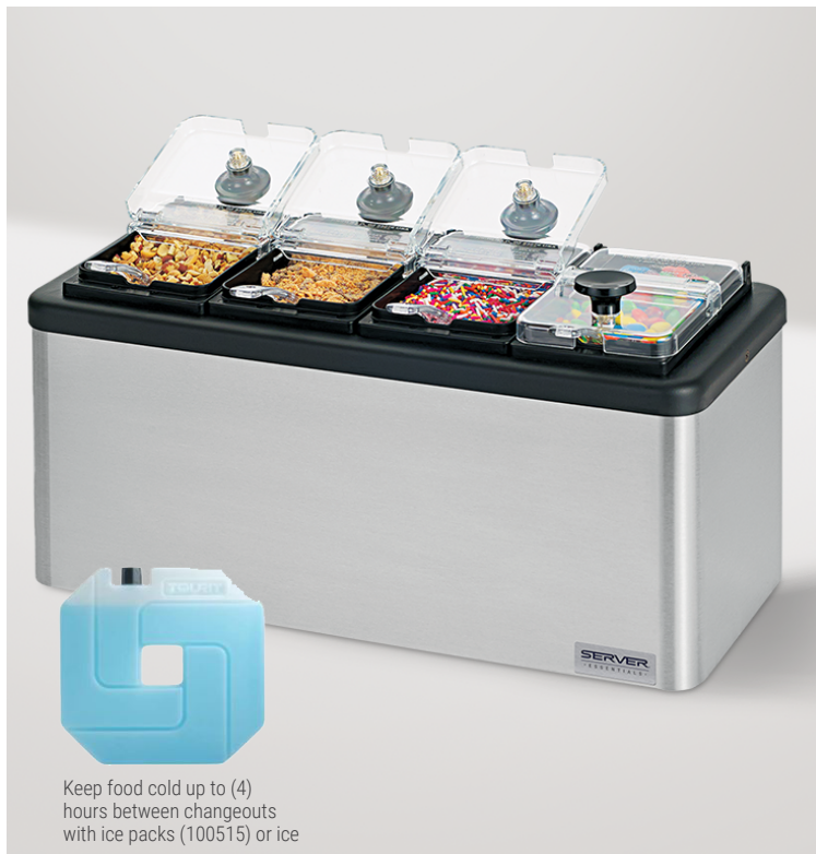
Keep food cold up to (4) hours between changeouts with ice packs (100515) or ice