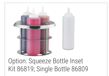
Option: Squeeze Bottle Inset Kit 86819; Single Bottle 86809