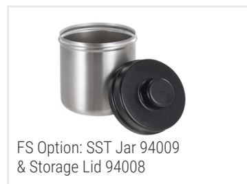
FS Option: SST Jar 94009 & Storage Lid 94008