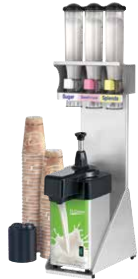
BEVERAGE STATION Model BS-ST