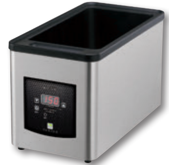
INTELLISERV™ WARMER Model IS-1/3