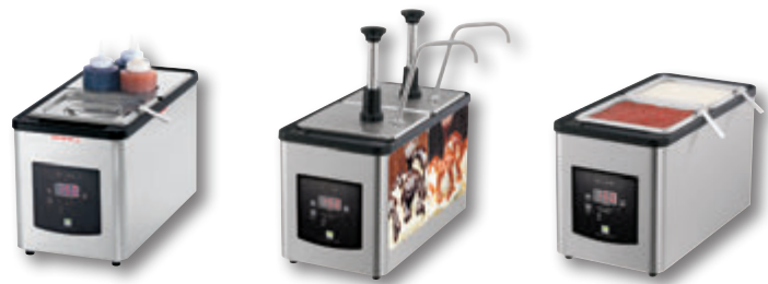
Various IntelliServ™ Combinations