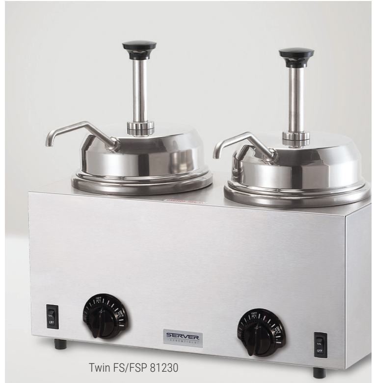
Twin FS/FSP 81230