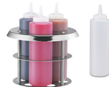
Option: Squeeze Bottle Inset Kit 86819; Single Bottle 86809

Critical to Proper Operation | Water-Bath Spacer 82063 (included)