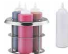
Option: Squeeze Bottle Inset Kit 86819; Single Bottle 86809

Critical to Proper Operation | Water-Bath Spacer 82063 (included)