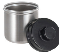
FS Option: SST Jar 94009 & Storage Lid 94008