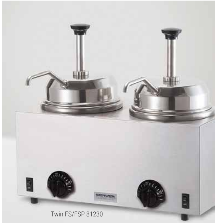
Twin FS/FSP 81230