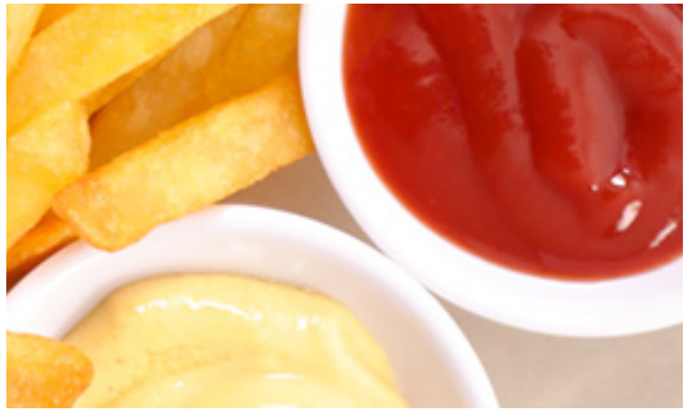
ARBY'S SE-5DI 07123