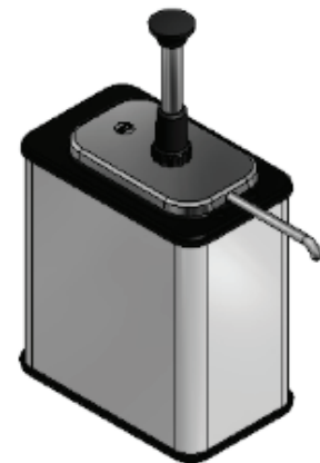
85860 Single Tall without Heated Spout - Includes Space for Backup Pouch, Heating in Reserve

* Short units (85880 & 85920) do NOT allow for a backup pouch heating in reserve.