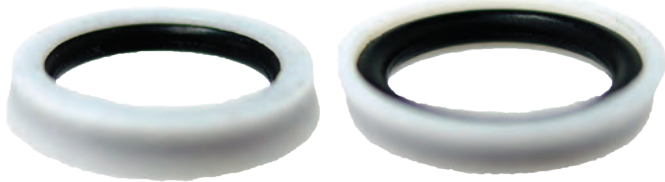
Original Seal 83003 Rev F