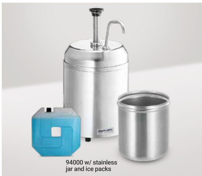
94000 w/ stainless jar and ice packs