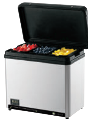
1/3-Size Pan Chiller