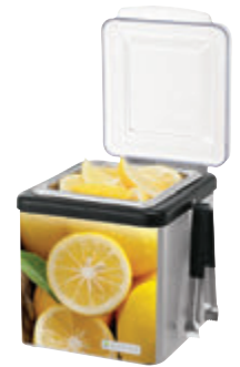
IRS-1 Lemon Server