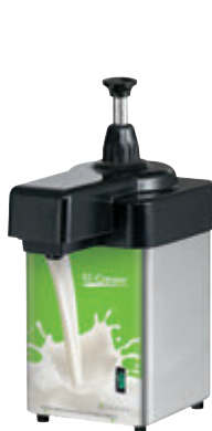
EZ-Cream™ Dairy Dispenser

The IRS-1 Lemon Server includes (1) 1/6-size pan, 6" deep, (2) Eutectic Ice Packs and tongs. This unit is ideal for keeping lemon wedges cold at self-serve beverage stations.