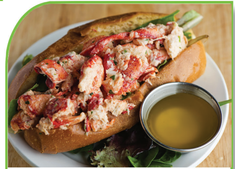
BUTTER MIX-N-SERVE™ Model MNS

Separate switches control heat and stir functions