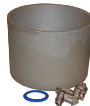
Can2Pouch Conversion Kit 81184