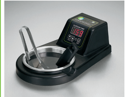
CONSERVEWELL™ Model CW-DI