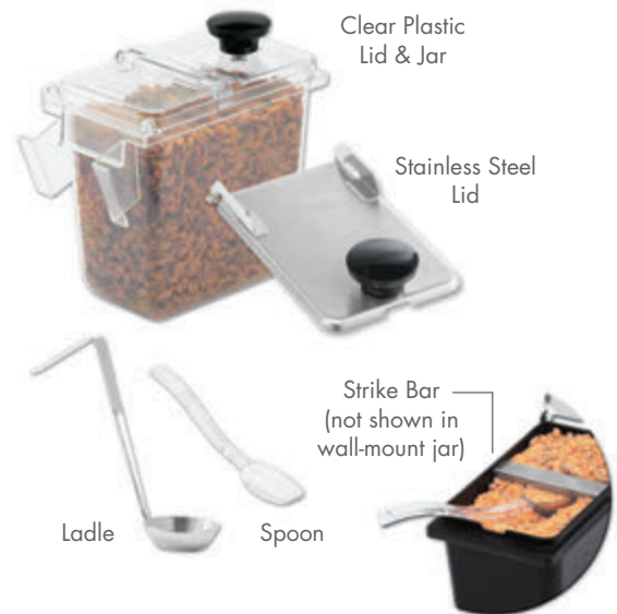
Strike Bar (not shown in wall-mount jar)