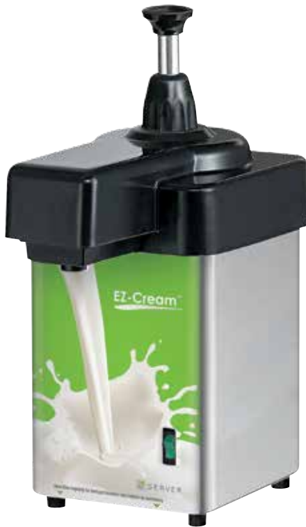
EZ-CREAM™ CSP 94160 \frac{5}{16} oz (9.2 mL)