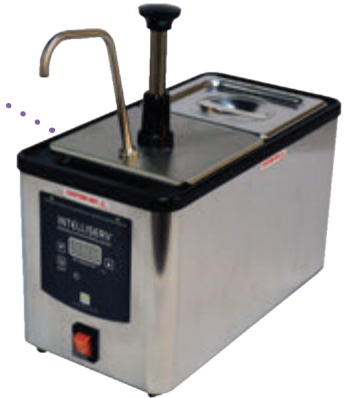
INTELLISERV™ WARMER Model IS-1/3