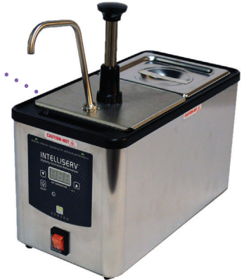
INTELLISERV™ WARMER Model IS-1/3