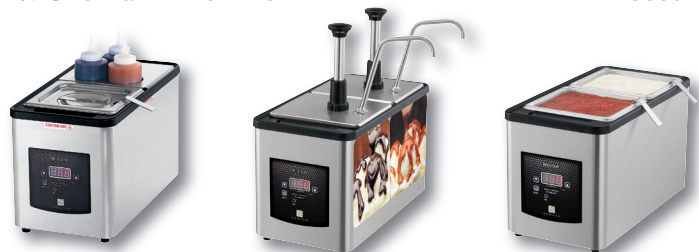
Various IntelliServ™ Combinations