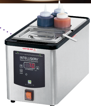
INTELLISERV™ WARMER Model IS-1/3