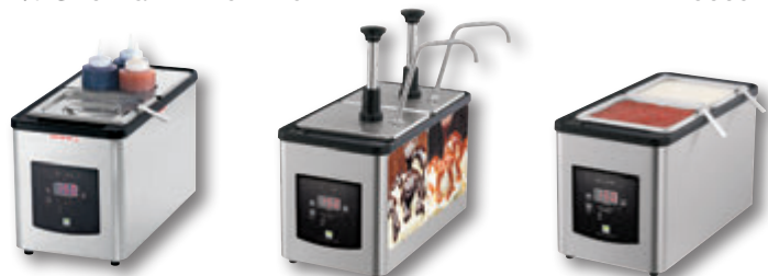
Various IntelliServ™ Combinations