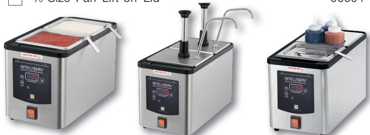
Various IntelliServ™ Combinations