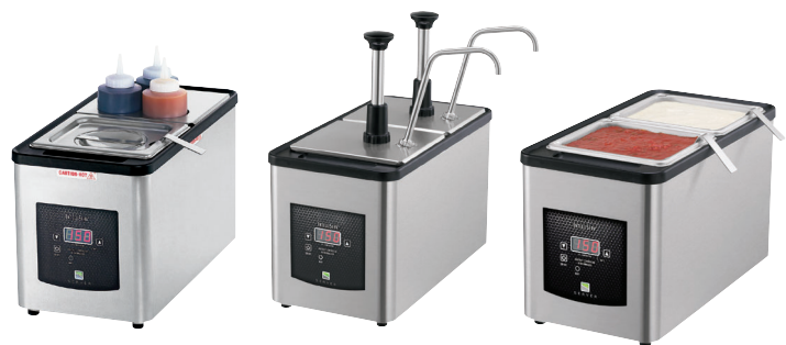
Various IntelliServ™ Combinations