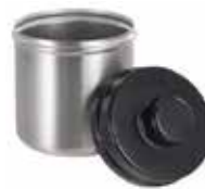
FS Option: SST Jar 94009 & Storage Lid 94008