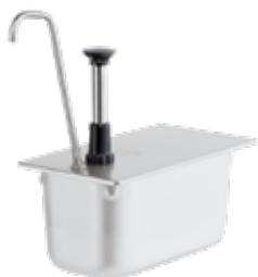
CP-1/3 Tall 83441