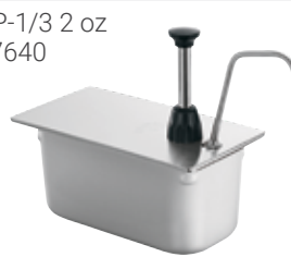
CP-1/3 2 oz 87640