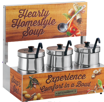
Triple station 87720