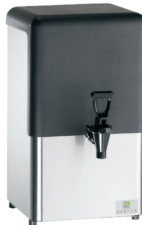
Mix-N-Serve® Butter Warmer/Mixer

Server's Mix-N-Serve® Butter Warmer/Mixer continuously stirs using a magnetic agitator to keep contents from separating. A removable melting basket suspends butter solids for replenishing throughout the day.