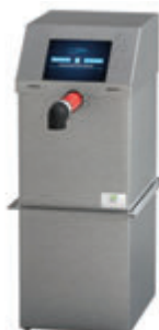
SE-SS-T DI 100368