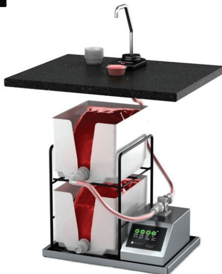
Sample front-of-house configuration